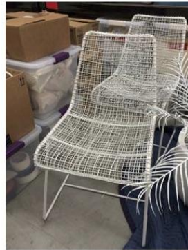
CHAIRS 2 & 3 18"x18"x32"