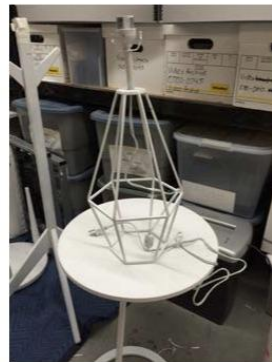
TABLE LAMP (w/o LAMP SHADE) 8"x8"x27"