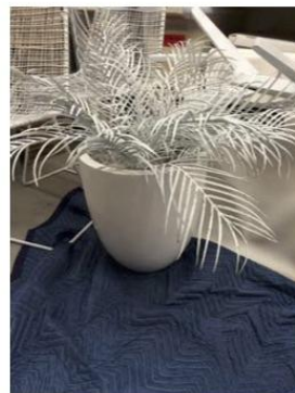
POTTED PLANT 20"x20"x30"