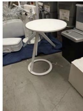
TABLE 2 16"x16"x20"