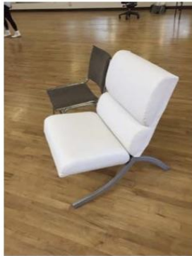
CHAIR 1 24"x35"x35"