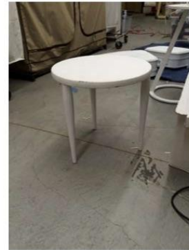
TABLE 1 15"x15"x15"